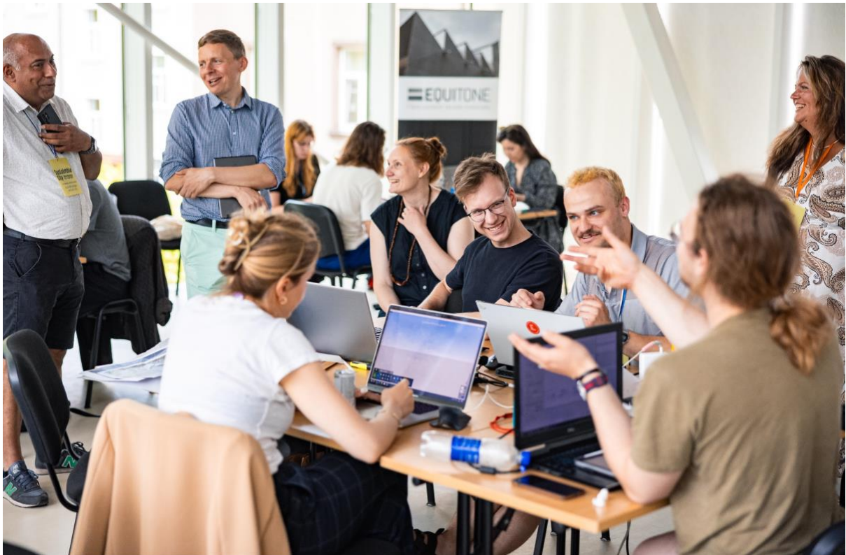
Workshop "Sustainable City" in Pärnu 2023

* BAUA - Baltic Architects Unions Association